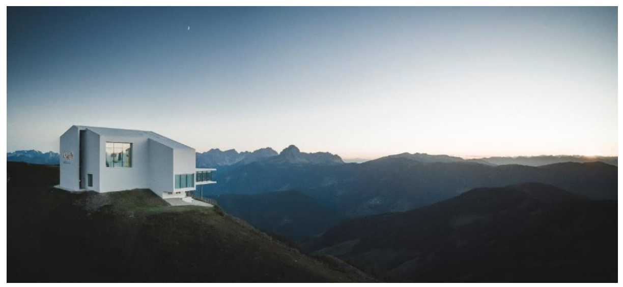
The LUMEN Museum of Mountain Photography on top of the Kronplatz (Plan de Corones)